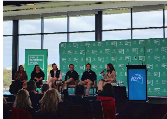
Small Business Week

A partnership with Glam Adelaide which included four sponsored articles as well as amplification across email and social media reached over 61.5k people. Collectively, the articles received over 12.1K views and an engagement rate of 81.29%.