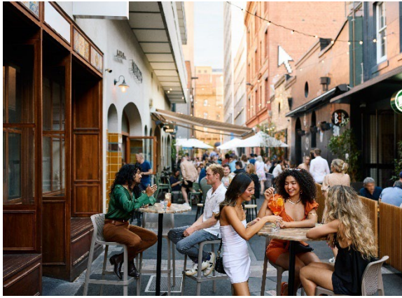
Winter Events Campaign

The 2025 Winter Events Campaign delivered in July continued to amplify city vibrancy and economic opportunity by encouraging spending across hospitality, accommodation, and entertainment, while reinforcing the City's reputation as a cultural, activity and entertainment centre.